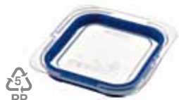
Tapa hermética Couvricle hermétique Airtight lid