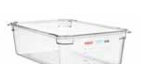
ref. 09828 / 20L 530 x 325 x h150 mm