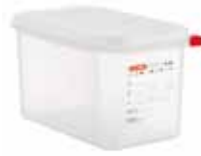
ref. 3028 / 4,3L 265x162x150 mm