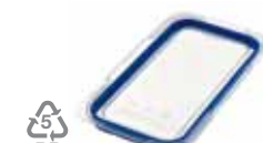
Tapa hermética Couvricle hermétique Airtight lid