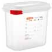
ref. 3022 / 1,5L 176x108x150 mm