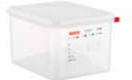
ref. 3035 / 12,5L 325x265x200 mm