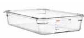
ref.09822 / 6L 325 x 265 x h 100 mm