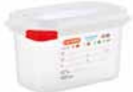
ref. 3021 / 1L 176x108x100 mm