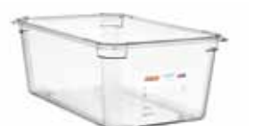
ref. 09835 / 25,3 L 530 x 325 x h 200 mm