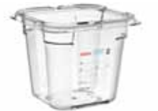
ref. 09798 / 2,15L 176 x 162 x h 150 mm