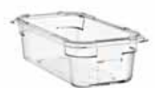
ref. 09817 / 2,8L 265 x 162 x 100 mm