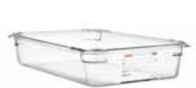
ref. 09827 / 13L 530 x 325 x h 100 mm