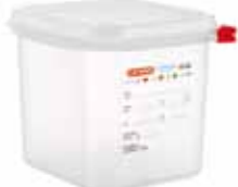
ref. 3025 / 2,6L 176x162x150 mm