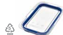
Tapa hermética Couvricle hermétique Airtight lid