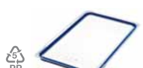
Tapa hermética Couvricle hermétique. Airtight lid