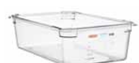
ref. 09823/ 9,5L 325 x 265 x 150 mm