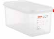
ref. 3031 / 6L 325x176x150 mm