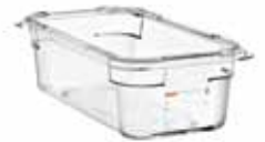
ref. 09819 / 4L 325 x 176 x 100 mm