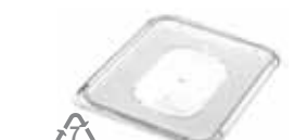
Tapa de apoyo Couvricle d'appui. Contact lid