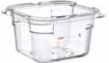
ref. 09797 / 1,5L 176 x 162 x h 100 mm