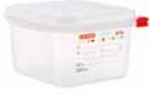
ref. 3024 / 1,8L 176x162x100 mm