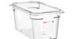
ref. 09820 / 6L 325 x 176 x 150 mm