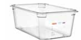
ref. 09834/ 11,3L 325 x 265 x h 200 mm