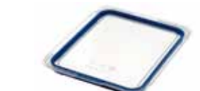
Tapa hermética Couvricle hermétique Airtight lid