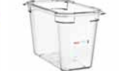
ref. 09831 / 6,7L 325 x 176 x h 200 mm