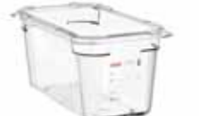
ref. 09818 / 4,3L 265x162 x h150 mm